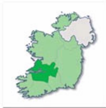
Fig. 1 The Shannon Region

Shannon Development has adopted a two-strand approach, enhancing the region’s economic environment while also nurturing innovation. To achieve this, it has been involved in a diverse array of activities. From the mid-nineties Shannon Development managed both the RIS and RIS+ programmes which piloted a number of projects such as a design network and a food innovation network in the region. The organisation was commissioned to prepare the Mid-West Regional Authority’s Development Plan in 1994. Shannon Development was a leader in the Southern and Eastern Regional Innovative Action Programme during the NDP 2000-2006, a programme which developed two themes, transfer of knowledge from the higher education sector to rural SMEs and the application of new ICT to rural communities. Other recent activities include