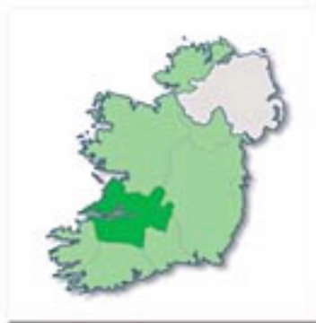
Fig. 1 The Shannon Region

Shannon Development has adopted a two-strand approach, enhancing the region’s economic environment while also nurturing innovation. To achieve this, it has been involved in a diverse array of activities. From the mid-nineties Shannon Development managed both the RIS and RIS+ programmes which piloted a number of projects such as a design network and a food innovation network in the region. The organisation was commissioned to prepare the Mid-West Regional Authority’s Development Plan in 1994. Shannon Development was a leader in the Southern and Eastern Regional Innovative Action Programme during the NDP 2000-2006, a programme which developed two themes, transfer of knowledge from the higher education sector to rural SMEs and the application of new ICT to rural communities. Other recent activities include